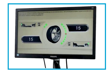
MONITOR 20 "WITH TIPS