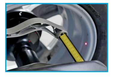
SPOT LASER INDICATOR