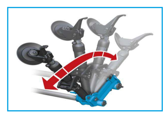
AUTOMATIC ARM POSITIONING