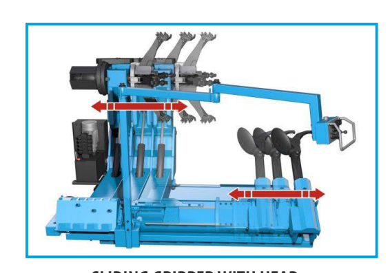
SLIDING GRIPPER WITH HEAD