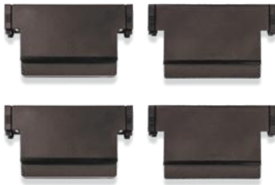
STDA128 (2 sets = 4 batteries) Two standard batteries and two spares