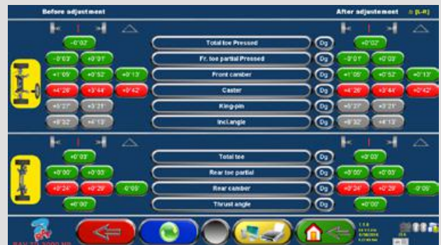
Data before and after adjustment