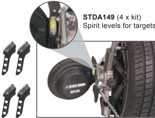
STDA149 (4 x kit) Spirit levels for targets

Two pair of 4-point wheel clamps for general usage