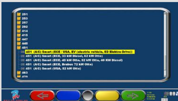
Original Mercedes database

Exclusive 3D targets: - extremely light - no electronic components inside