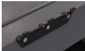
STDA117 Pair of brackets for lift mounting