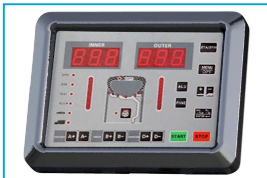
CONTROL PANEL ON LED