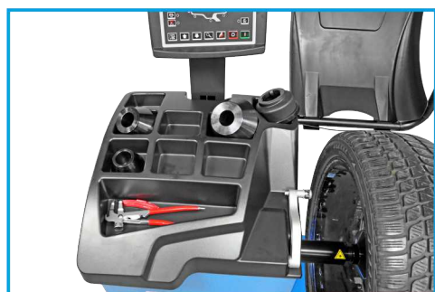
CONVENIENT TOOL BOX

Balancing machine designed for balancing passenger car wheels and light truck ♦ automatic wheel distance measurement from balancing machine and rim diameter using a retractable measuring cup ♦ automatic wheel width measurement using sonar ♦ automatic wheel positioning ♦ active protective hood, automatic wheel braking, programs: static, dynamic and ALU ♦ electric brake ♦ footbrake ♦ quick optimization function, unbalance sharing and hiding weights behind the shoulders of the rim ♦ the ability to change units: inch / millimeter and gram / gram, auto-diagnosis and calibration program.