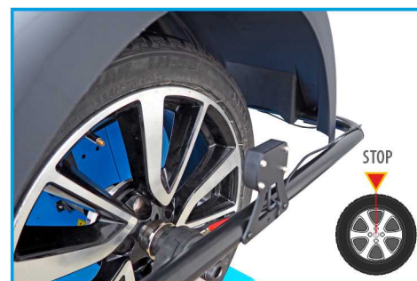
AUTOMATIC POSITIONING WHEELS IN THE POINT OF IMBALANCE