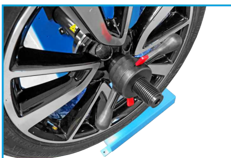
NUTRUNNER IN A BALANCER WITH A CLUTCH