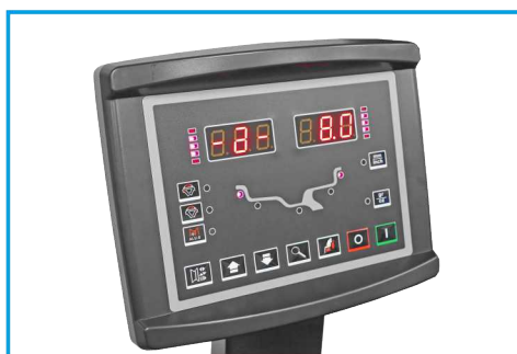
INTUITIVE CONTROL PANEL