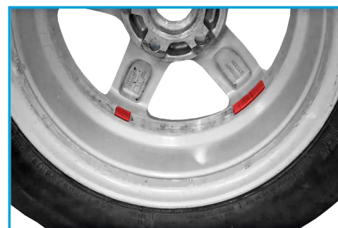
WEIGHT HIDING FUNCTION BEHIND WHEELS ARMS!