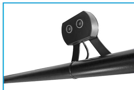
SONAR FOR MEASURING RIM WIDTH