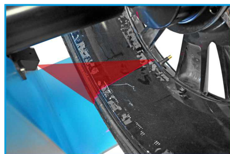
LINEAR LASER POINTER