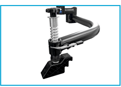
HELPING ARM PRESSURE WITH HEIGHT ADJUSTMENT