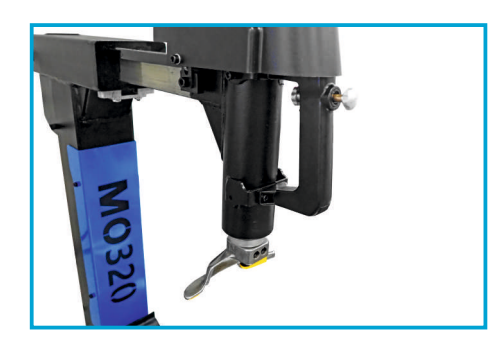
PNEUMATICALLY TILTING COLUMN AND LOCKABLE HEAD

tire changer designed for mounting and dismounting tires for passenger cars, light commercial vehicles, and motorcycles • pneumatically tilting and locking column • standard equipment includes protective mounting inserts • two-speed turntable controlled by foot pedal • inflation gauge with integrated manometer, foot pedal operated • standard equipment includes an helping arm