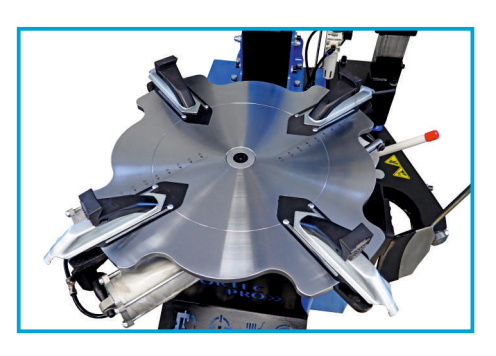
PROFILED TABLE MADE OF HIGH-STRENGTH STEEL