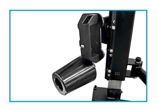
PRESSING ROLLER OF THE HELPING ARM