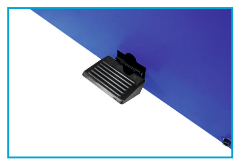
FOOT PEDAL-CONTROLLED WHEEL INFLATION SYSTEM