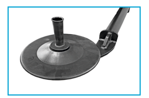
HELING ARM PLATE ASSISTING IN TIRE MOUNTING/DISMOUNTING