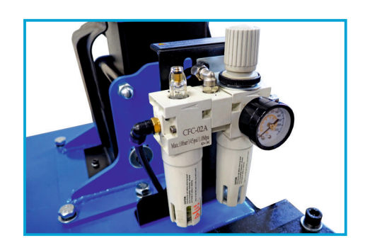
AIR PREPARATION UNIT INCLUDED AS STANDARD EQUIPMENT