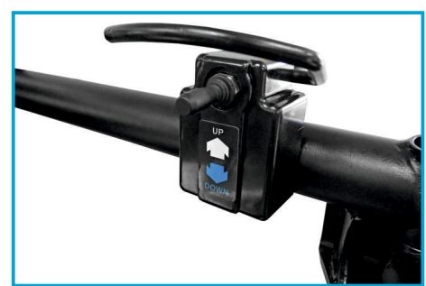
PNEUMATICALLY CONTROLLED HELPING ARM