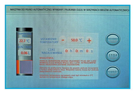
OIL HEATING OPTION

BUILT-IN DATABASE WITH PICTURES HOW AND WHERE TO CONNECT THE WIRES