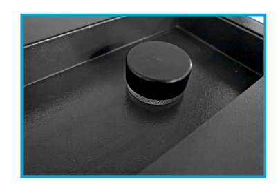
FRESH OIL FILLING