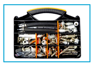
IN STANDARD SUITCASE WITH 66 CONNECTORS (BMW, VAG, MERCEDES, TOYOTA, VOLVO ECT.)