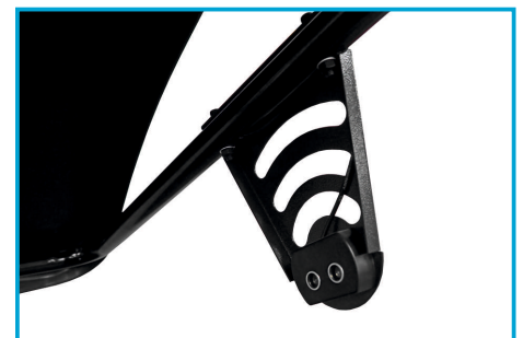
SONAR TO MEASURE THE RIM WIDTH