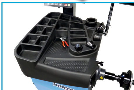
CONVENIENT TOOL BOX