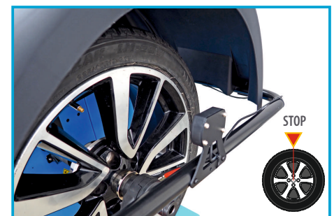
AUTOMATIC POSITIONING WHEELS IN THE PLACE OF UNBALANCE