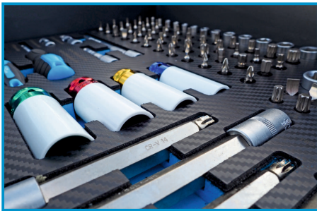
SOCKET WRENCHES AND BITS

The Nortec WN359XXL tool trolley is a professional workshop setup that includes an impressive 359 pieces , providing versatility and functionality. The set includes, among others: sockets , screwdrivers, pliers , open-end and ring spanners, punches , hex keys, a torque wrench , and impact sockets . The trolley is distinguished by its solid construction and stability, making it exceptionally resistant to heavy loads and intensive use. The tool cabinet features a soft-close drawer system , offering convenience in use and efficient tool storage.