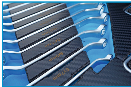
RING AND OPEN-END SPANNERS