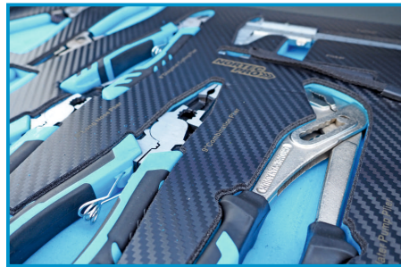
VARIOUS TYPES OF PLIERS