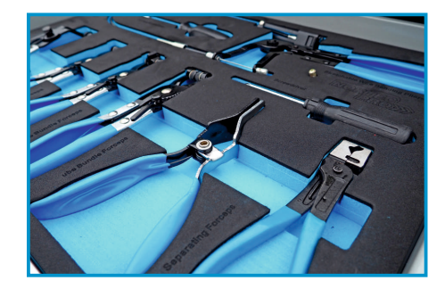
VARIOUS TYPES OF PLIERS