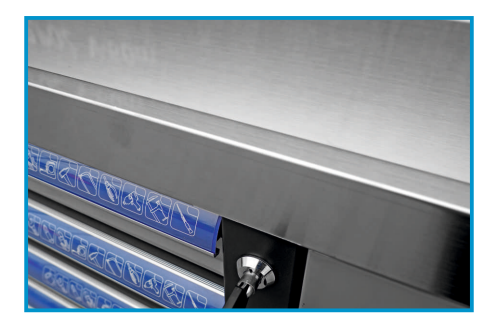
SOLID AND STRONG STEEL WORKTOP