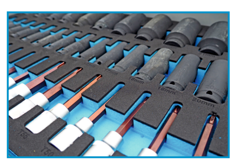
IMPACT SOCKET WRENCHES