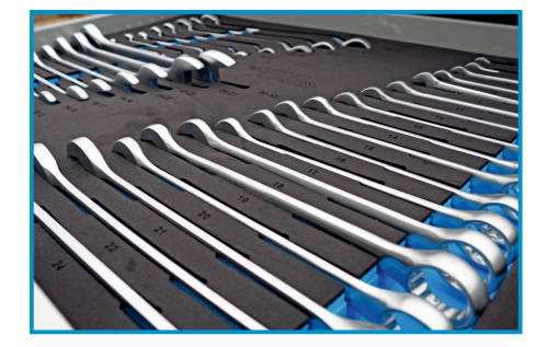
RING AND OPEN-END WRENCHES