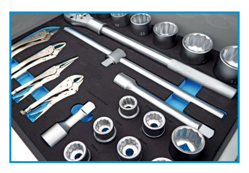
SOCKET WRENCHES UP TO 50 MM

The Nortec WNTRUCK tool trolley is a sturdy and functional solution designed for servicing heavy-duty vehicles. Equipped with 140 tools , it offers a wide range of options, including sockets up to 50 mm , open-end and ring spanners, screwdrivers, and impact socket wrenches . The 95 kg construction ensures stability and durability, while the solid steel worktop provides a convenient workspace.