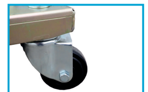
SMALL SWIVEL WHEELS