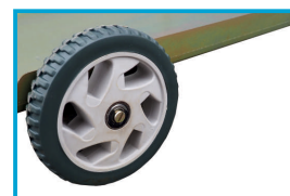
LARGE FULL WHEELS