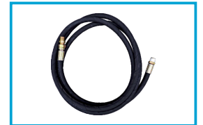
OIL HOSE 4 M