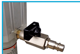
AIR INTAKE VALVE