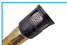
OIL SCREEN (FILTER)